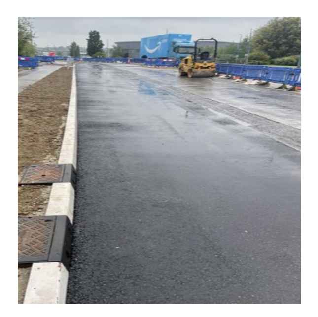
Newly resurfaced carriageway (southbound)