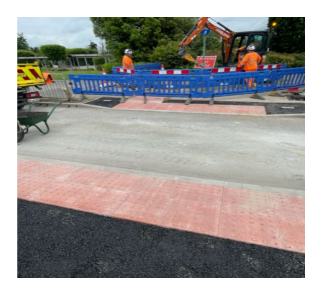
Tactile paving installed for pedestrian crossing