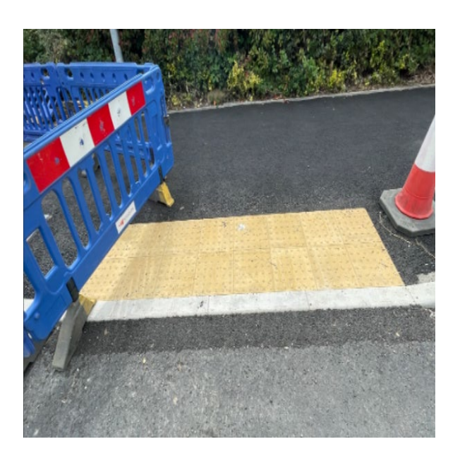
Tactiles for uncontrolled pedestrian crossing Installed