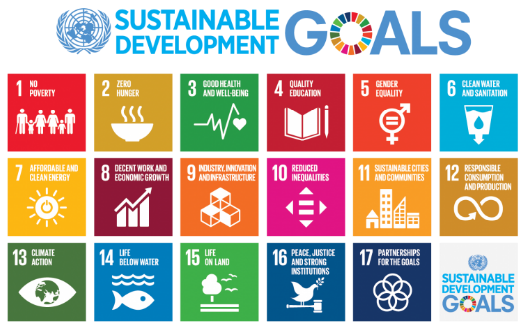
Figure 1 UN Sustainable Development Goals.

4.1.1 The UN Sustainable Development Goals (SDGs) as illustrated in Figure 1 recognise primary Biodiversity Goals (SDG 14 and 15) seek to conserve and sustainably use the marine and terrestrial environment respectively. Ultimately all 17 SDGs ultimately depend on healthy ecosystems and biodiversity<sup>17</sup>.