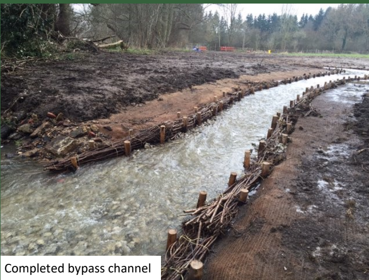
Completed bypass channel

The Sundridge bypass channel project was delivered as a partnership with North West Kent Countryside Partnership (NWKCP), Environment Agency, The Rivers Trust, Department of Environment Food and Rural Affairs (DEFRA) and Kent County Council.