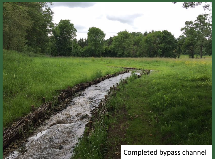
Completed bypass channel