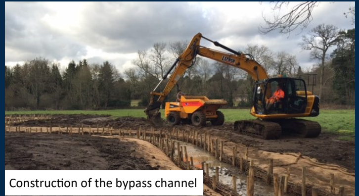
Construction of the bypass channel

The project has delivered both flood risk managements and biodiversity benefits.